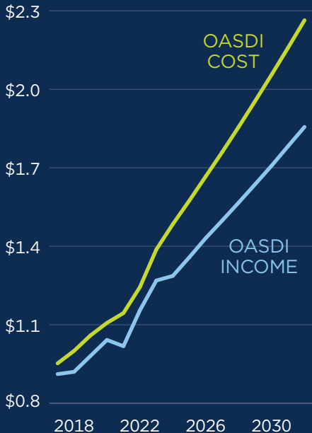
COSTS AND INCOME, IN TRILLIONS