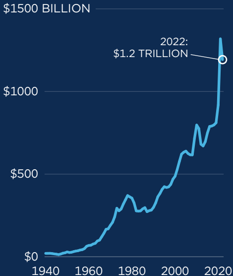
FEDERAL TRANSFERS TO STATE AND LOCAL GOVERNMENTS, IN 2023 DOLLARS