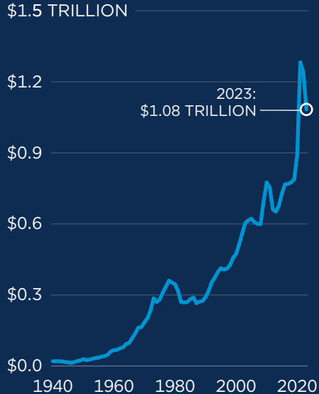
FEDERAL TRANSFERS TO STATE AND LOCAL GOVERNMENTS, IN 2024 DOLLARS