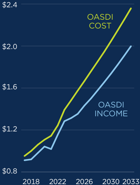
COSTS AND INCOME, IN TRILLIONS